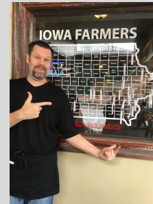
Local Food Finder/ Certified Local