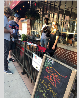
Local Food Festival