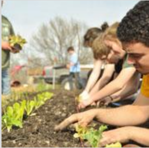
Farm to School